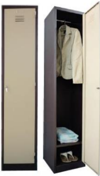
1 Compartment Steel Locker S114/D - Size (15"D) : 381W x 381D x 1828H (MM) S114/DS - Size (18" D) : 381W x 457D x 1828H (MM) * With Cloth Hanging Bar