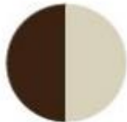
TWO TONE (BROWN + BEIGE)

- 4 Drawers Filing Cabinet with Recess Handle c/w Ball Bearing Slide Size : 465W x 625D x 1320H (MM)