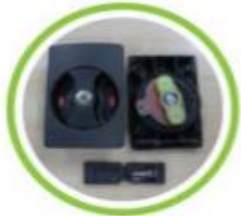
SLK-S118 Cupboard Lock