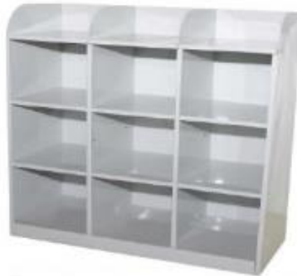
9 Pigeon Holes Side Table Size : 915W x 381D x 890H (MM)