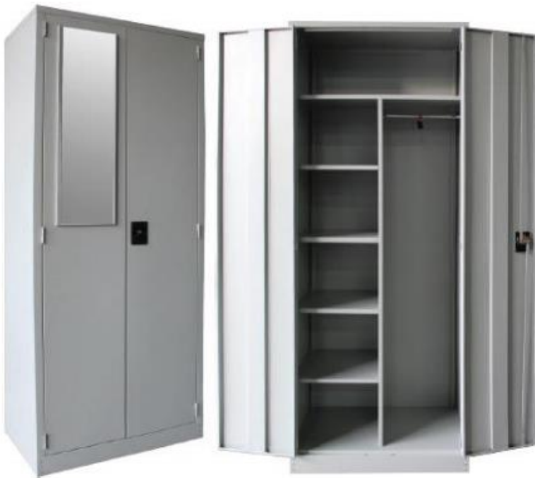
Full Height Wardrobe with Steel Swinging Door c/w 1 Mirror & Cupboard Lock, 1 Top Shelf, 1 Divider, 4 Small Fixed Shelf & 1 Cloth Hanging Bar Size : 750W x 470D x 2100H (MM)