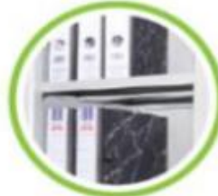
SSV-S118 Shelf S112 / S118 / S199/ S200 c/w 4 Clip