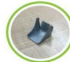
S135 Shelf Clip