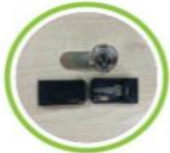
SLK-S114 Locker Lock