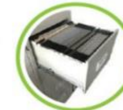
S128-L Filing Pocket - Link (2 Sets x 25 pcs / Box)