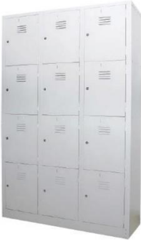
12 COMPARTMENT STEEL LOCKER