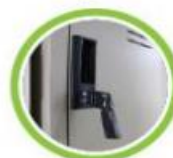
SLK-S114-HL Handle Cam Lock