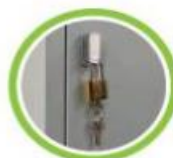
SLK-S114-LL Latch Lock