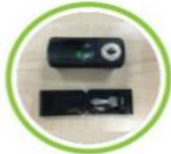
SLK-S119 Sliding Door Lock