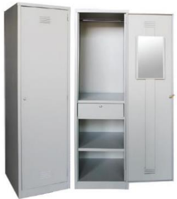
1 Compartment Steel Locker with Steel Swinging Door c/w 1 Cloth Hanging Bar, 1 Mirror, 1 Centre Drawer with Camlock & 1 Fixed Shelf at bottom Size : 457W x 508D x 1828H (MM)