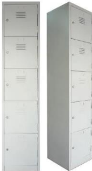
5 Compartments Steel Locker S114/E - Size (15"D) : 381W x 381D x 1828H (MM) S114/ES - Size (18" D) : 381W x 457D x 1828H (MM)