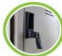
SLK-S114-HL Handle Cam Lock