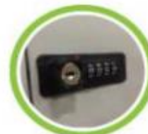
SLK-S114-DL Digital Combination Lock