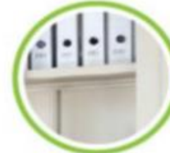
SSV-S119 Shelf S110 / S111 / S116 / S119 c/w 4 Clip