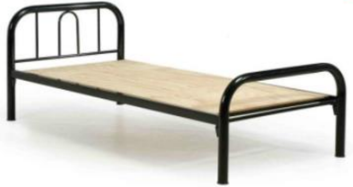
Metallic Frame Single And Double Bed Frame With Plywood Base Black