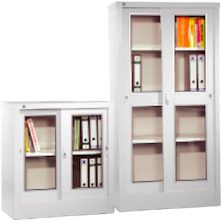
FULL HEIGHT AND HALF STEEL CUPBOARD WITH GLASS