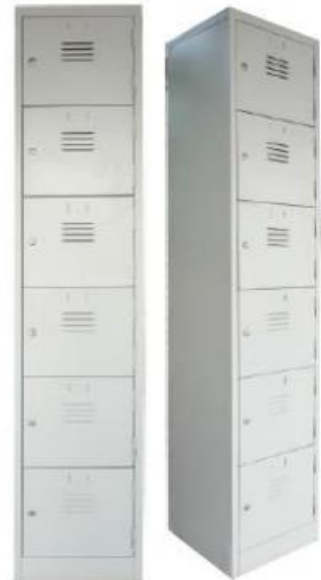
6 Compartments Steel Locker S114/A - Size (15"D) : 381W x 381D x 1828H (MM) S114/AS - Size (18" D) : 381W x 457D x 1828H (MM)