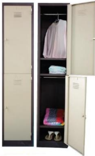
2 Compartments Steel Locker S114/C - Size (15"D) : 381W x 381D x 1828H (MM) S114/CS - Size (18" D) : 381W x 457D x 1828H (MM) * With Cloth Hanging Bar