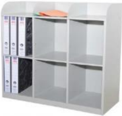
6 Pigeon Holes Side Table Size : 915W x 381D x 930H (MM)