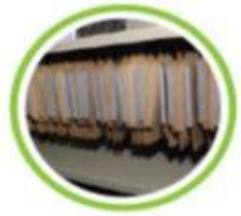
SSV-S117 Shelf S117 c/w 4 Clip