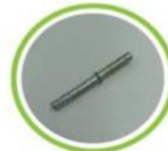
S134 Locker Pin