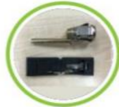
SLK-S106 Drawer Lock