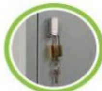
SLK-S114-LL Latch Lock