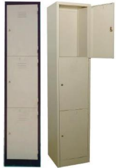
3 Compartments Steel Locker S114/3 - Size (15"D) : 381W x 381D x 1828H (MM) S114/3S - Size (18" D) : 381W x 457D x 1828H (MM)